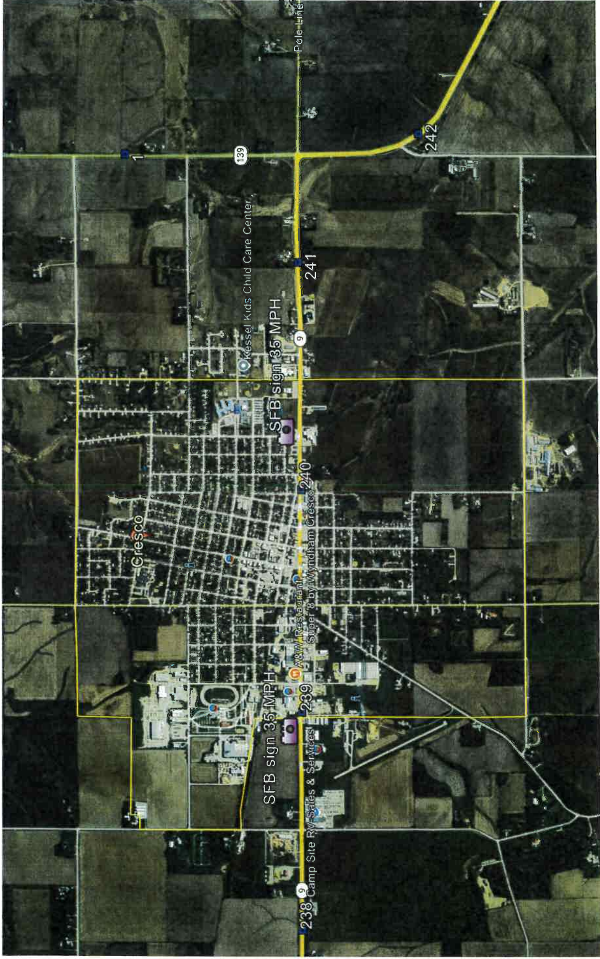
EB IA 9 at milepost 238.896, lat and long 43.371008, -92.131347 with 35 MPH sign